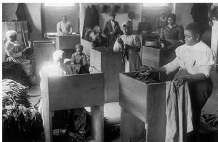
Tobacco stemmers, circa 1937